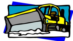
Street Cleaning: 2"